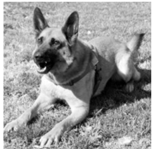
Blitz's speed and trained nose bring an added tactic to protect and serve Bel Air residents.