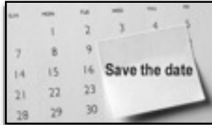
CALENDAR OF EVENTS PAGES 6 - 8