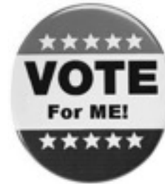
Wanted: Town Commissioners 2017 PAGE 10